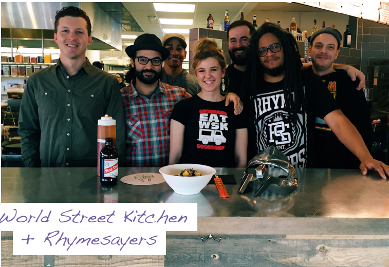
World Street Kitchen + Rhymesayers