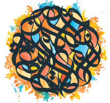
Brother Ali + eL Seed